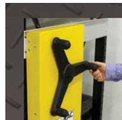
MECHANICAL ASSIST OPERATION with three-spoked handle with rotating hand knobs for ease of use.