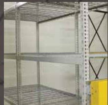
STORAGE CONFIGURATIONS Accommodates various pallet racking and shelving.